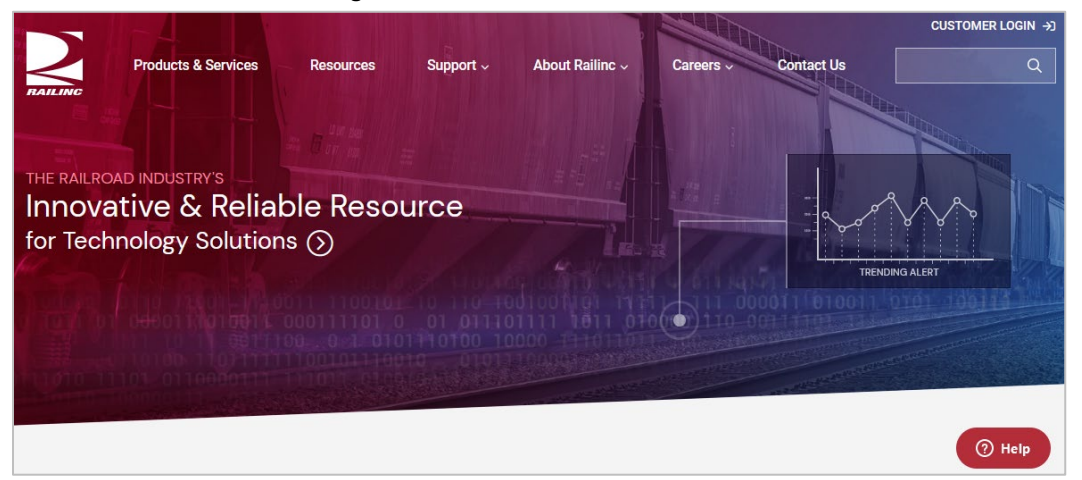
Exhibit 3. Railinc Welcome Page